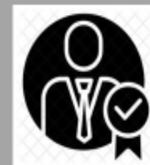
Certified advisors/extension officer