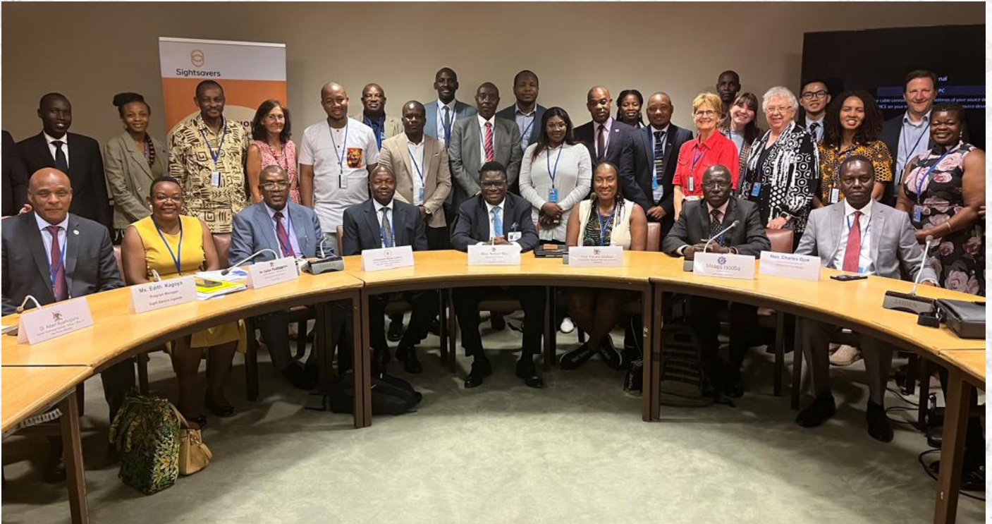
Delegates posing for a group photo after Uganda's side event on July 11 th , 2024 at the UN Headquarters in New York

Uganda also held bilateral meetings including a courtesy call meeting with the President of the UN General Assembly, a meeting with Deputy Foreign Affairs Minister of the Republic of Belarus, a meeting with the Assistant Secretary General