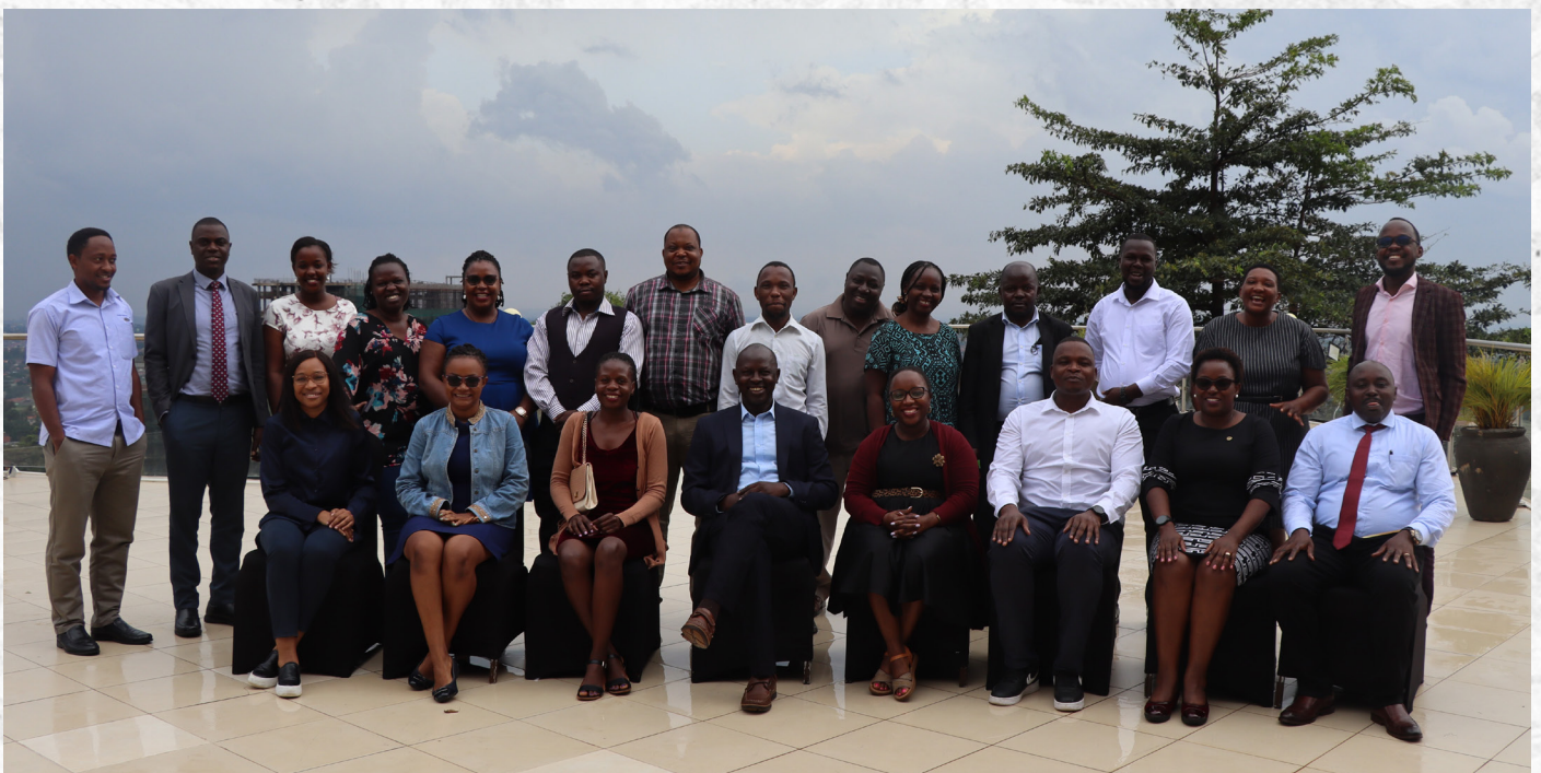
Participants of the diagnostic assessment pose for a group photo

Notable achievements include incorporating gender and equity compliance into the national budget; prioritizing gender and inclusion in the National Development Plan III (NDPIII); and embedding gender mainstreaming in performance assessments of government bodies"