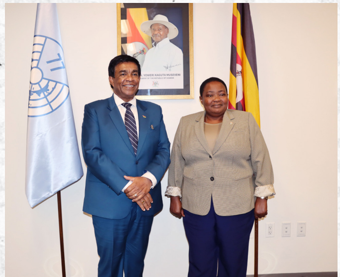
Rt Hon Prime Minister of the Republic of Uganda Robinah Nabbanja poses for a photo with H.E Mr. Prithvirajsingh Roopun, President of Mauritius after a bilateral meeting.