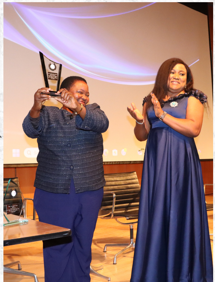
The Rt Hon Robinah Nabbanja receiving the Global Inspirational Leadership Award at the Global Power Conference 2024 in New York