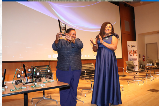
The Rt Hon Prime Minister of the Republic of Uganda Robinah Nabbanja receives an award at the Global Power Women Conference in New York