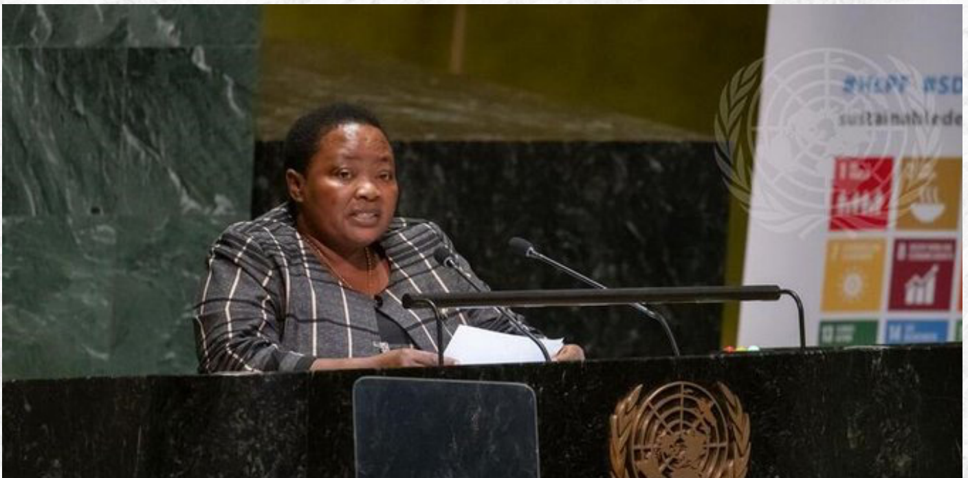
The Rt Hon Prime Minister of Uganda Robinah Nabbanja delivers a statement at the 79 th session of the United Nations General Assembly on 23 rd September 2024 in New York

The 79 th Session of the United Nations General Assembly was held in New York, from 21 st - 28 th September, 2024, under the Presidency of H.E. Amb. Philemon Young of Cameroon. It was a unique session with two distinct components held during the high level week, namely the Summit of the Future which took place on 22 nd - 23 rd September, 2024 and the annual UN General Assembly from 24 th – 28 th September 2024. The events were held under different themes. The theme for the Summit of the Future was ‘Multilateral solutions for a better tomorrow’ , and that of the 79 th Session was “Leaving no one behind: acting together for the advancement of peace, sustainable development and human dignity for present and future generations” .