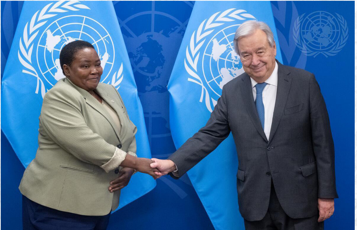
The Rt Hon Prime Minister of Uganda Robinah Nabbanja poses for a photo with the United Nations Secretary General His Excellency Antonio Guterres after the bilateral meeting at the United Nations Headquarters in New York.

Other bilateral meetings included the meeting with H.E Mr. Philemon Yang, President of the 79 th Session of the General Assembly, meeting with H.E Mr. Moussa Faki, Chairperson of the African Union Commission, meeting with H.E Sheikh Shahboot Bin Nahyan Al Nahyan, Minister of State for Foreign Affairs of U.A.E, and meeting with Prof Jeffrey Sacks and Investors. At the sideline of the 79 th session of the United Nations General Assembly, Uganda participated in events that included; 6th Meeting of the European Cooperate Council of Africa and the Middle East (ECAM) Uniting Continents – Forging Cooperation in Healthcare, Education, Research, the Agro – Industry and Green Energy; Generation Equality dialogue on Multilateralism in times of pushback and regression held at UN Women Head Quarters in NY and hosted by the Deputy Executive Director of UN Women; and the Global Power Women Conference 2024.