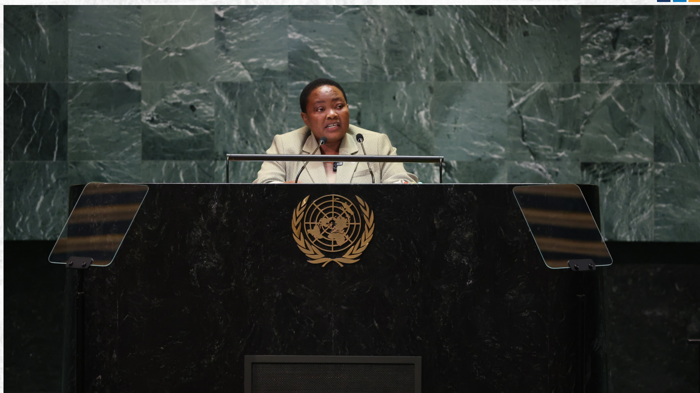
Rt. Hon Prime Minister making a statement on behalf of Group 77+China on 15 th July 2024 at the United Nations head Quarters in NewYork.

On the first day of the Ministerial session at the High Level Political Forum, the Rt. Hon Prime Minister presented a statement on behalf of the G77+China. Rt. Hon Prime Minister making a statement on behalf of Group 77+China on 15 th July 2024 at the United Nations head Quarters in NewYork.