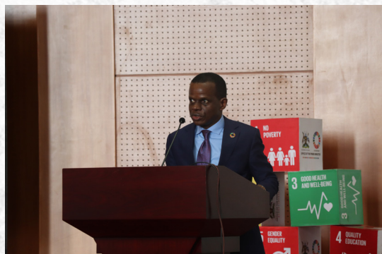
Uganda will host the 11 th Africa Regional Forum on Sustainable Development (ARFSD-11) in April 2025. The Deputy Executive Secretary Mr. Antonio Pedro of the United Nations Economic Commission on Africa at the launch of the ARFSD-11 Preparatory Activities on 4 th September 2024.