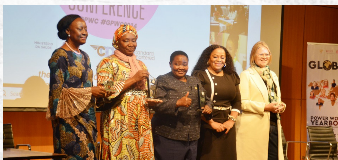
The Rt Hon Prime Minister of the Republic of Uganda Robinah Nabbanja poses for a photo with other awardees

While receiving the global award, Nabbanja said that Uganda has made substantial strides towards gender equality through progressive laws and policies. The Prime Minister also noted that women need further empowerment to transform the world especially in the financial sector.