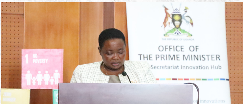
The Rt Hon Prime Minister of Uganda Robinah Nabbanja while launching the Preparatory activities of the ARFSD-11 on 4 th September 2024 at the Conference Hall, Office of the President, Kampala

The eleventh session of ARFSD, themed "Driving Job Creation and Economic Growth through Sustainable Inclusive Science and Evidence-Based Solutions for the 2030 Agenda and Agenda 2063," will gather ministers, officials, experts, and stakeholders from the private sector, civil society, academic institutions, and United Nations entities.