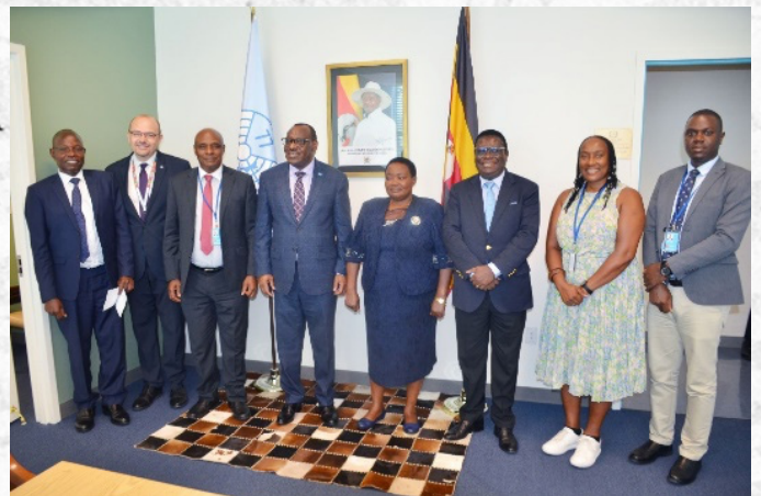
Rt. Hon Prime Minister 4 th right, Mr. Claver Gatete on her left with other participants after the meeting at Uganda House in New York on 17 th July 2024..